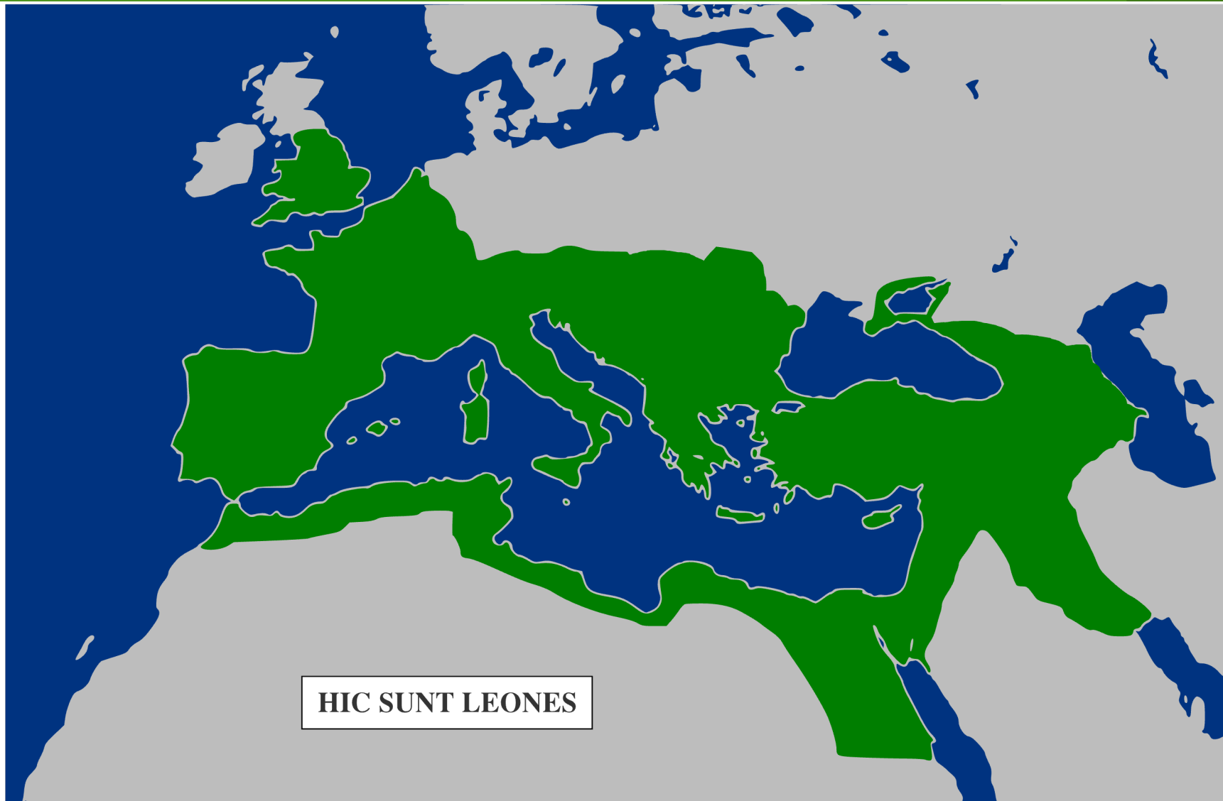
The Roman Empire in 117 AD, at its greatest extent